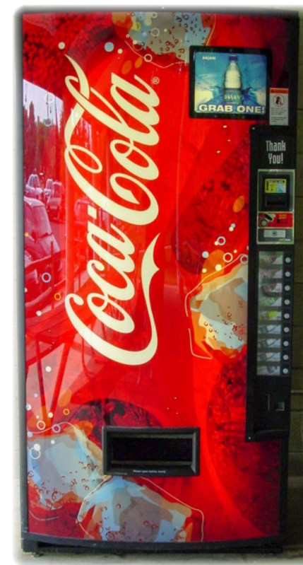
Fitting a time clock to vending machines such as this can payback in under a year

Energy saving opportunities for office based companies (CTV007)